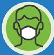
Wear a face mask