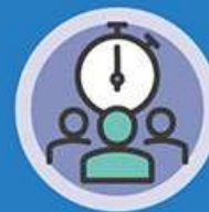
Limit time in close contact